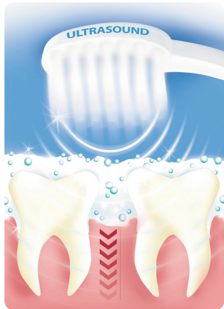
The emmi®-pet ultrasound removes bacteria on and deep in the gums

The positive effect and safety have been proven and confirmed by dentists and implantologists. The dental and mouth care with Ultrasound have been applied for years, without any side-effects. Millions of Ultrasound waves are generated every minute by the patented Ultrasound chip in the brush head. The ultrasound waves are transmitted via each bristle to the Ultrasound toothpaste, where millions of micro-bubbles build up. Their microscopic minuteness enable the micro-bubbles to penetrate the smallest gaps, tooth interspaces, fissures and gum pockets. Contaminations, food remains and plaque are durably removed and bacteria are reduced by the implosions of the micro-bubbles. The emmi®-pet is an Ultrasound unit for dental and mouth care in animals on the basis of the emmi®-dent Professional, which since 2009 has been supplied to hundreds of thousands satisfied customers worldwide.